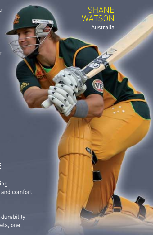
SHANE WATSON Australia