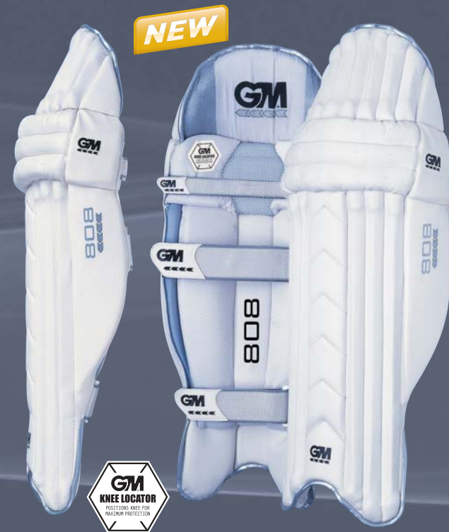
5532 808 OSM · MENS · SMALL MENS · YOUTHS · BOYS Replicates many features of the Original Limited Edition Batting Pad Quality wipe clean PU face for comfort and durability Lean back top hat feature and superb wrap around the thigh for protection where you need it! Traditional knee roll gives superb wrap around and comfort One piece interior bolster prevents movement of vital protection Triple vertical internal bolsters giving great protection and flexibility New internal knee bolster shape which positions the knee for maximum protection PVC instep material giving comfort and extreme durability