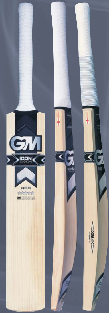
5520 ICON DXM® 808 5 STAR BAT MENS · ACADEMY · HARROW · 6 · 5 · 4 · 3