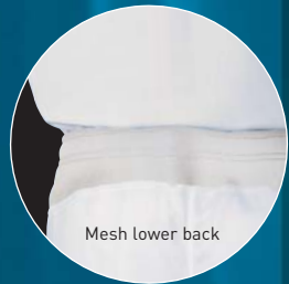
Mesh lower back