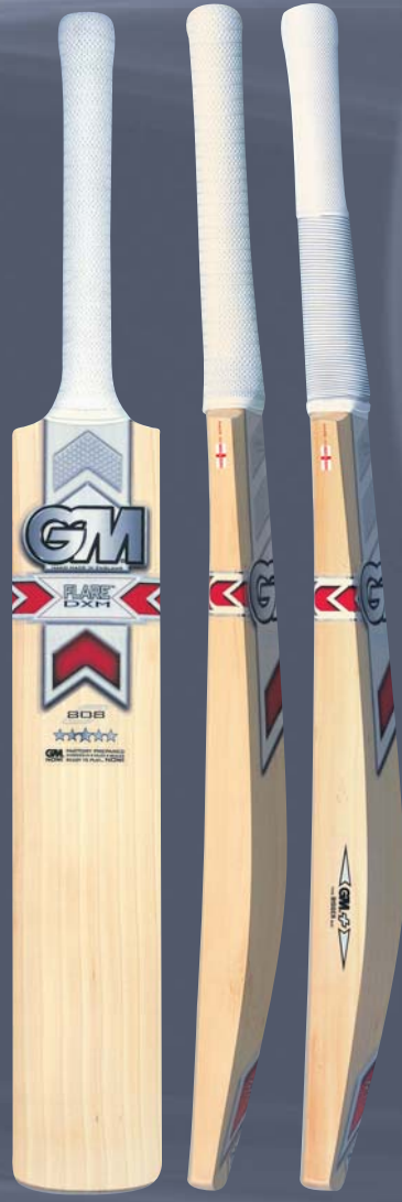
5530 FLARE™ DXM™ 808 5 STAR BAT MENS · HARROW · 6 · 5 · 4 · 3