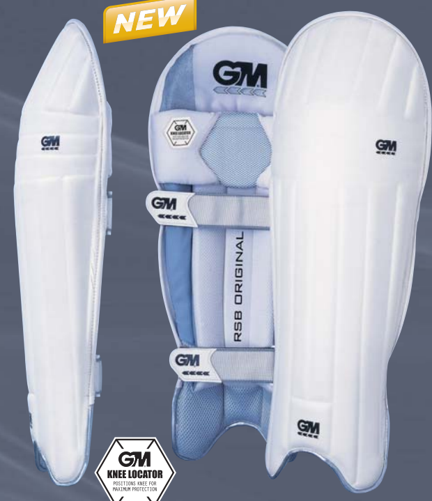
5536 RSB ORIGINAL OSM · MENS · SMALL MENS Designed in association with Ravi Bopara Ultra lightweight pad with International quality protection Ambidextrous design which suits right and left handed batsmen Quality wipe clean PU facing Triple vertical internal bolsters giving great protection and flexibility Strong internal knee locator and new internal knee bolster shape which positions the knee for maximum protection Abrasion resistant instep material for long life