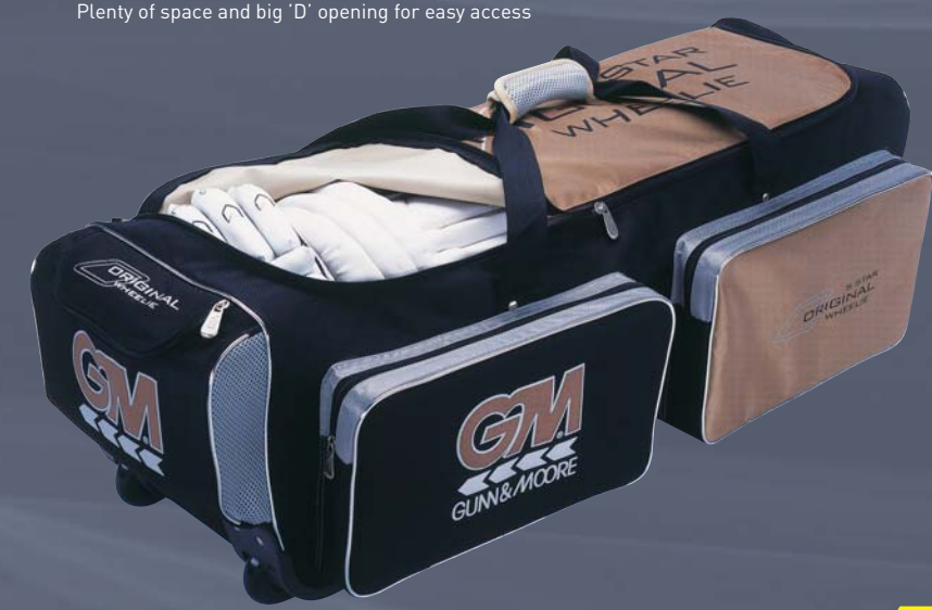
5570 5 STAR ORIGINAL WHEELIE 96cm x 36cm x 31cm 1200 denier Polyester fabric, hard wearing Moulded rubber handle for easy pulling and comfort Rust proof GM designer zip pullers Anti-scoff corner protection Heavy duty integrated wheel system for durability Zipped end pocket and zipped side pockets, one with multiple accessories feature Shoe tunnel to pack shoes separate from other kit Plenty of space and big 'D' opening for easy access