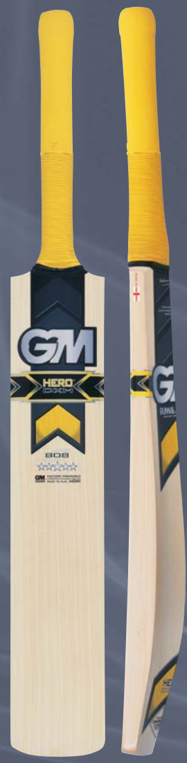
5540 HERO DXM® 808 5 STAR BAT MENS · HARROW · 6 · 5 · 4 · 3