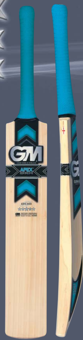
5550 APEX™ DXM™ 808 5 STAR BAT MENS · HARROW · 6 · 5 · 4 · 3