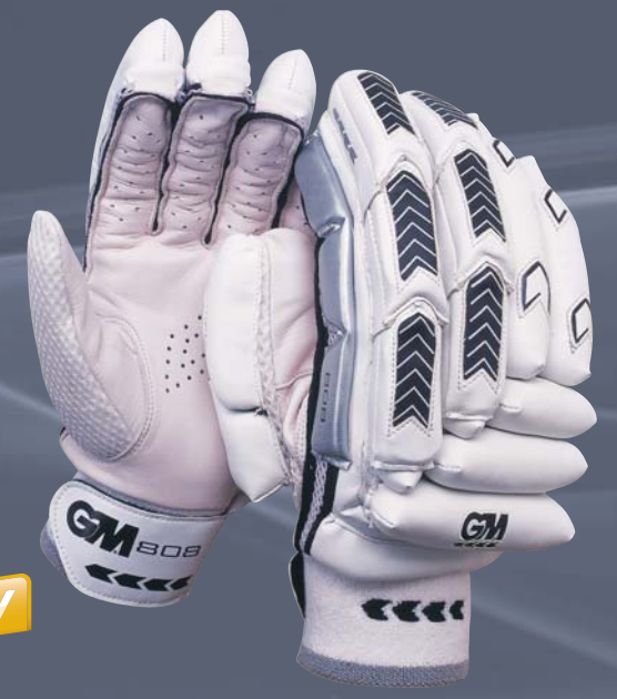
5546 808 OSM · MENS · SMALL MENS · YOUTHS · BOYS Replicates many features of the Original Limited Edition Batting Glove Calf leather palm giving durability and comfort Horizontal bolsters giving greater flexibility of the 3rd and 4th fingers Multi-layered individual overflaps to first two fingers of the bottom hand with chevron moulded foam inserts giving maximum protection in exposed areas Tri-Chevron split overflaps giving greater flexibility and manoeuvrability Breathable fingers giving added comfort Foam underlay to the back of the hand for added all day comfort Three-piece side bar protection to bottom hand giving complete protection